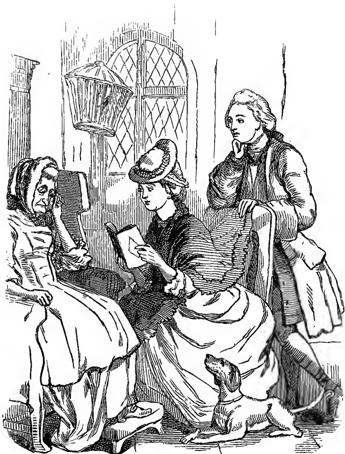
A Ministering Angel.